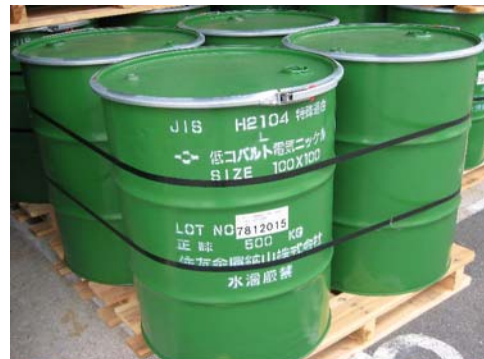
500kg drums on pallet